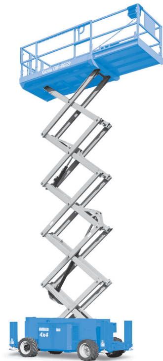
07/15 Part No. B127284UK